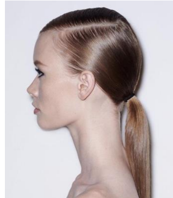
Hair Example Photo